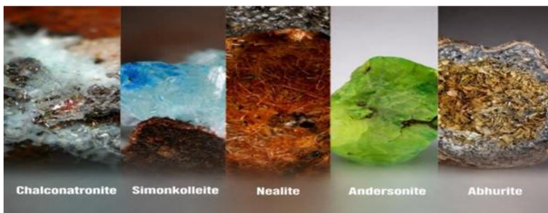
Figure 1. Anthropogenic minerals formed as a result of human technological processes