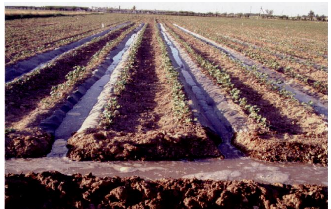
Mulching irrigation technology