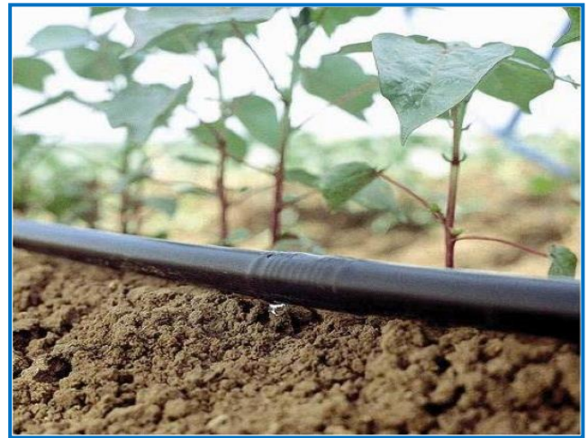
Drip irrigation technology

The required water layer is determined according to the following formula.