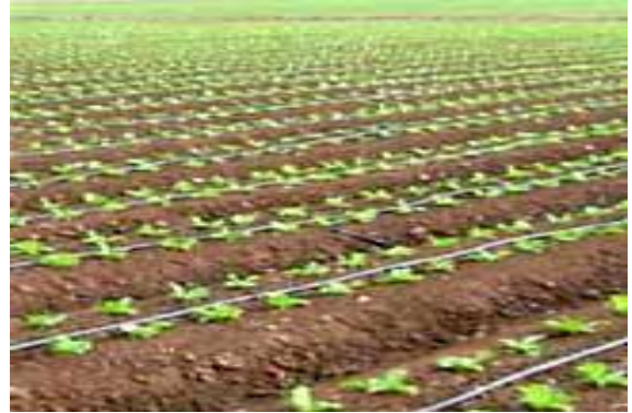
Water-saving irrigation technology