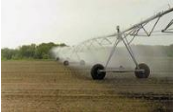
Rain-fed water-saving irrigation technology

\varphi – water consumption coefficient, accounting for the distribution of moisture across the profile (for heavy soils, \varphi = 1.12 ; for sandy soils, \varphi = 1.10 ; for light soils, \varphi = 1.05 ; for sandy loam soils, \varphi = 1.0 ).