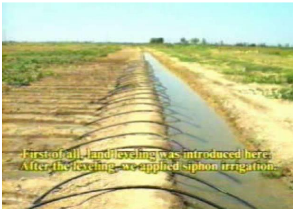
Irrigation through siphon system