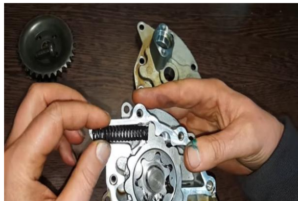
Figure 6. Oil pump repair

Or it simply stretches due to the wear and tear or poor quality of the steel from which it is made. Another option is that over time, the valve lumen becomes clogged. This is especially true if the car is filled with poor-quality dirty oil or the oil filter is already very worn out. When the pressure reducing valve fails, the oil pressure increases sharply when the engine speed is high.