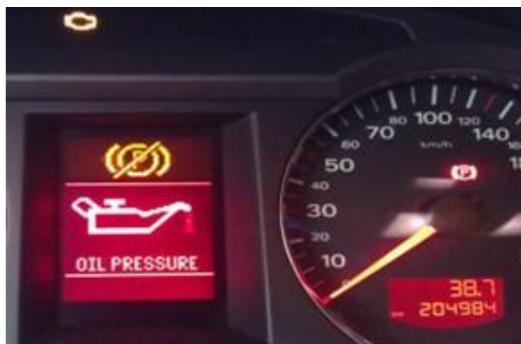
Figure 1. Olive oil sensor

The oil lamp is inactive when the engine is running and there is a sufficient level of lubricating fluid, that is, it does not light up. If it catches fire, this indicates that there are malfunctions, such as a low oil level in the crankcase, low pressure in the engine oil system (for example, the oil filter is clogged, the oil pump is not working properly), the oil level sensor is out of order, and some other less common ones. In any case, if the oil pressure light is on or blinking, you must first check the level of the lubricating fluid. If its indicator is normal — then you need to look for the reason that caused such an indication and eliminate it.