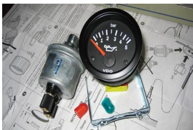
Figure 2. Temperature oil indicator

Before considering the reasons why the oil lamp may light up, it is necessary to fix the definitions. Control lamps in the car are controlled by the BCS — the so-called on-board control system. It monitors all the lamps displayed on the instrument panel (turning on / off turn signals, low / high beam, parking brake signal, etc.). Including oil level and pressure lamps. In some cars (newer or more advanced), these lamps are separated, while others (older) usually have only one lamp, and it is activated when the pressure of the lubricating fluid in the crankcase of the engine is low. Usually, a yellow icon (oil pan) on the dashboard indicates a low oil level, and a red lamp indicates a low pressure. On modern multi-function displays, the corresponding labels may appear instead of the "oil pan".