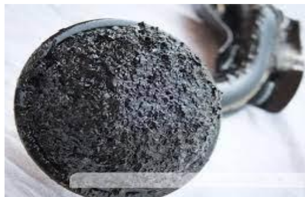
Figure 7. Clogged oil pump mesh

Clogged oil pump mesh. Here the situation is similar to that described with the oil filter. If it is clogged, less oil passes through the grid than it should, which leads to a decrease in pressure in the system and a decrease in its level. In addition, in such a situation, the oil pump runs on wear, which