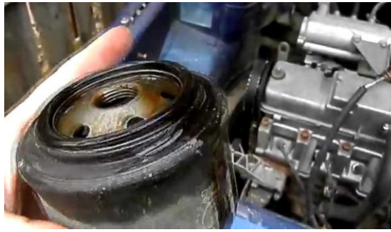
Figure 5. Oil filters

Accordingly, the oil from the filter drains back into the sump pan, and after starting the engine for the first few seconds it gains pressure. This is a very bad situation, since this leads to increased wear of parts, which means a decrease in their overall service life. Usually, after starting the engine, the oil lamp lights up.