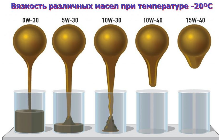
Figure 4. Viscosity of various oils at temperature

Incorrectly selected oil. In particular, its viscosity, especially for low-temperature viscosity. If it thickens in the cold, then it is difficult for the pump to pump it through the system and the pressure in it is insufficient, which is recorded by the corresponding sensor. Similarly, during the operation of the machine, the viscosity changes (or the oil simply gets dirty), so there may be a situation when the pressure sensor is triggered in certain situations and the oil pan indicator will either light up or blink.